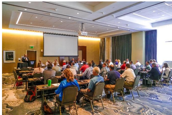
Panel discussion on commissioning