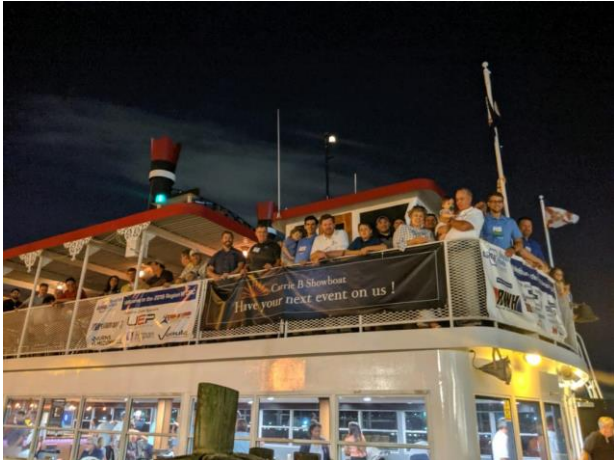
Welcome Reception aboard the Carrie B Showboat