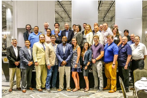
Region III Delegates, Alternates, Vice Chairs, and Society Dignitaries